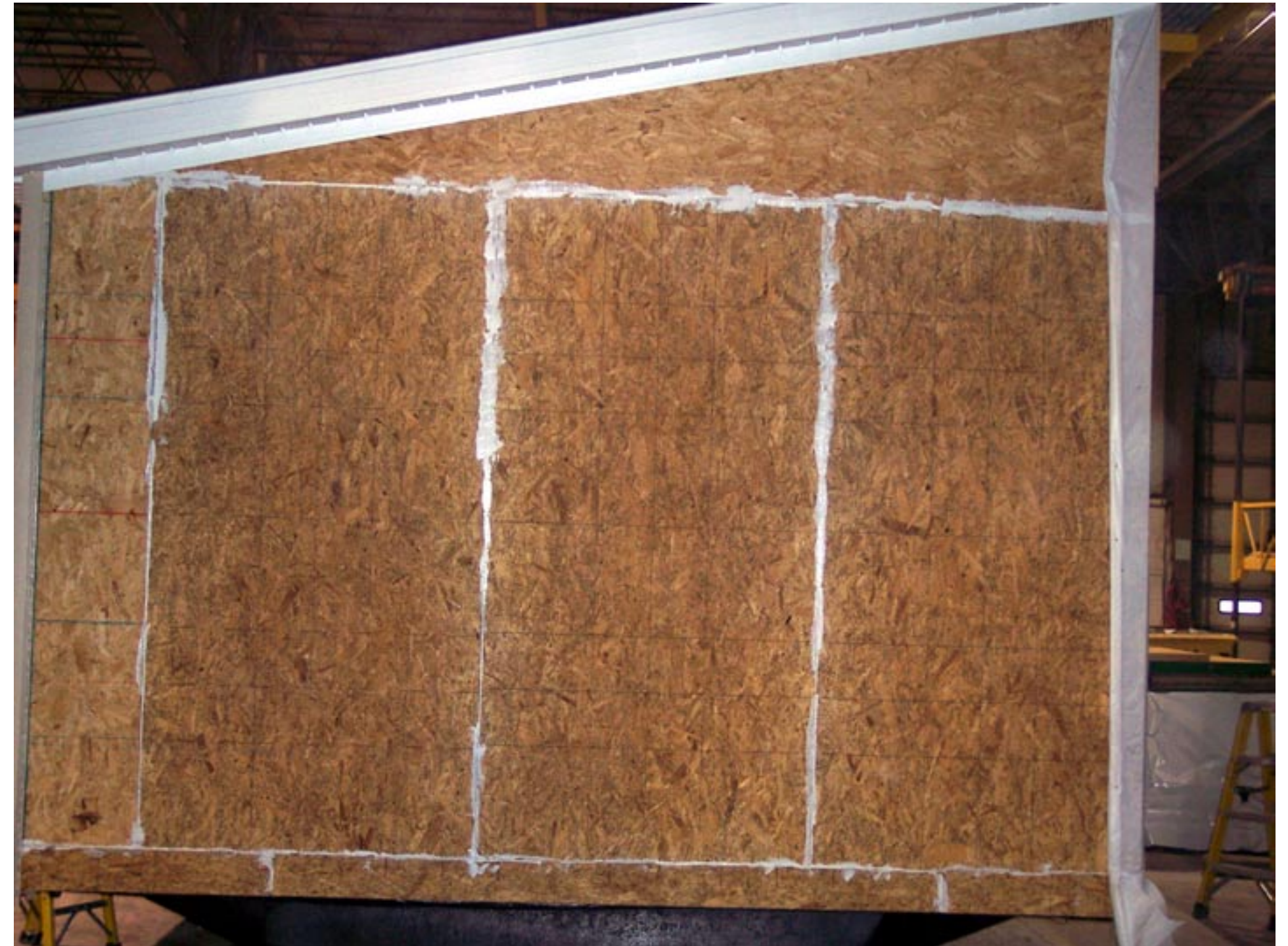
Sealed Exterior Seams for Air Infiltration Protection