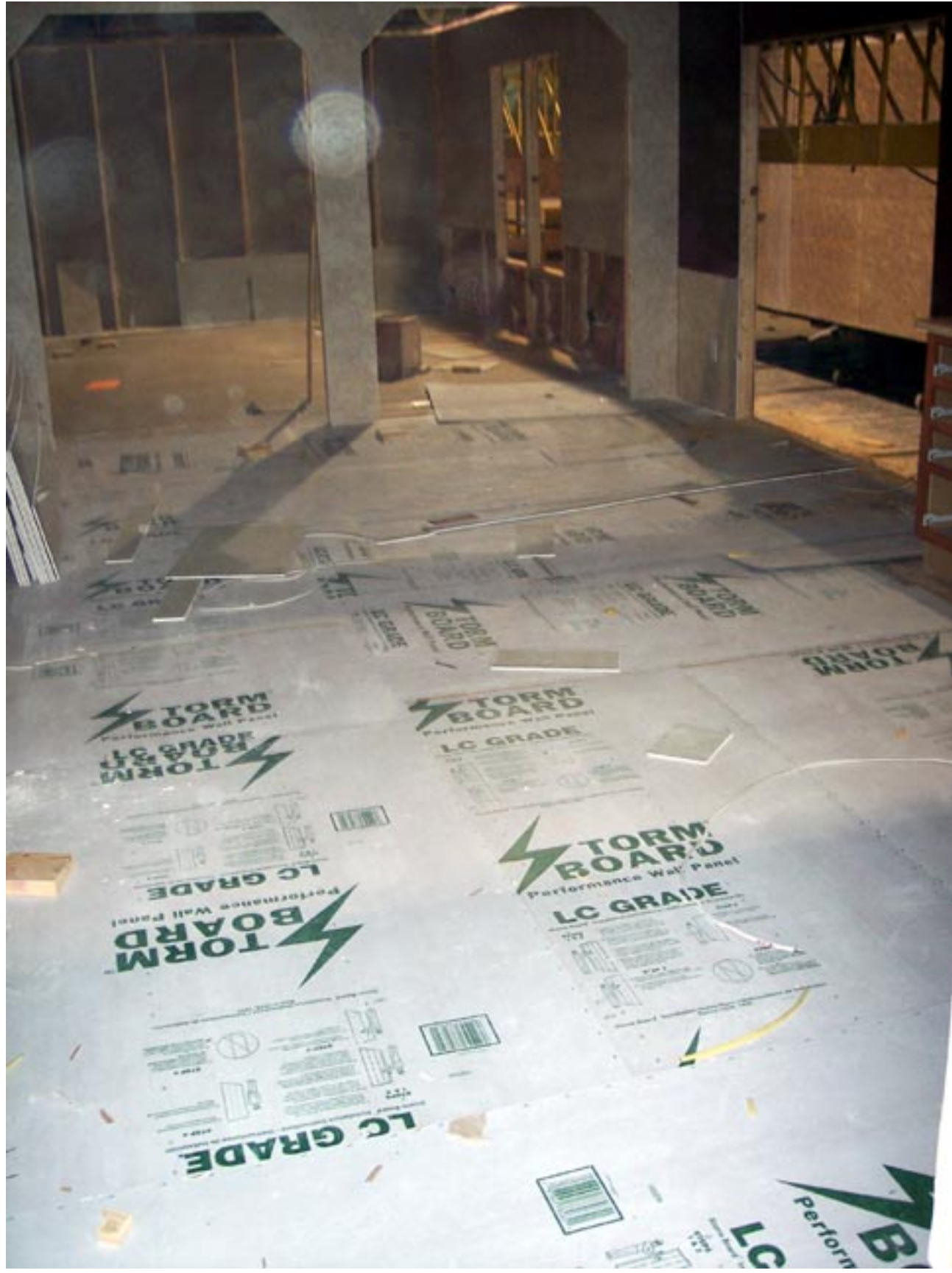
Lino Areas are Protected During the Entire Assembly Process