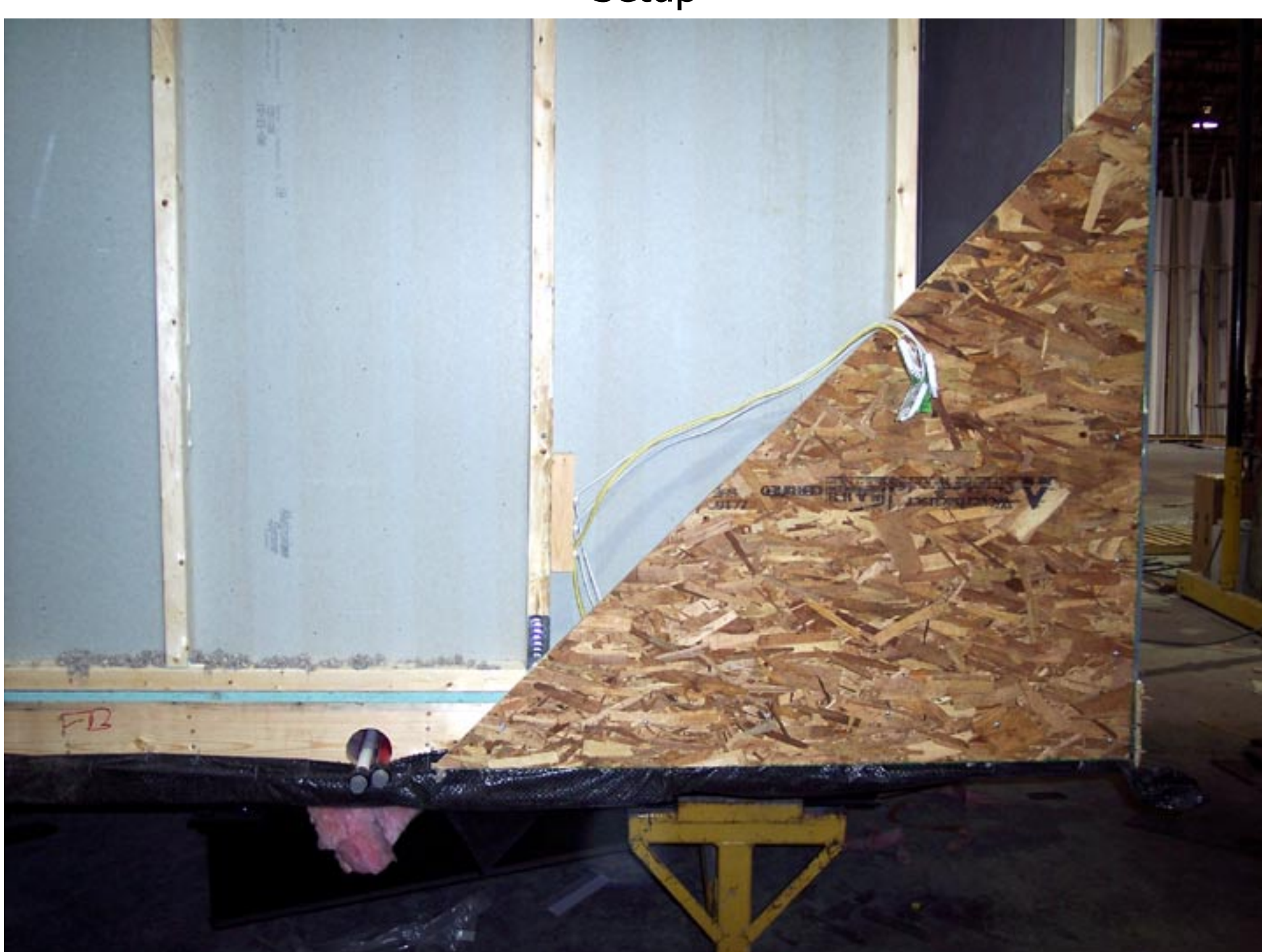
For Ease in Setup, Electrical Crossovers are at One End of the Home. OSB Supports are Installed for Transportation Purposes to Ensure a Quality Delivery