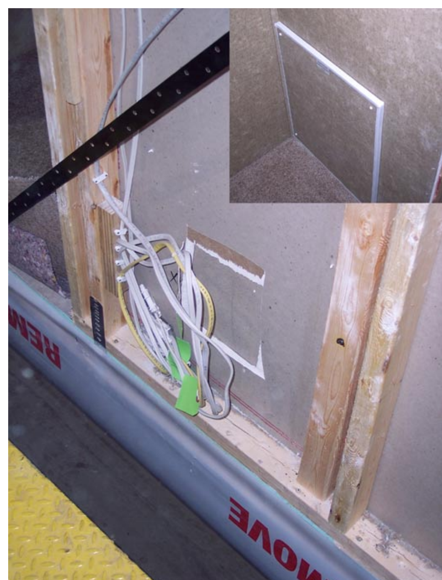
Electrical Crossovers are Labeled with Easy Access from Inside the Home