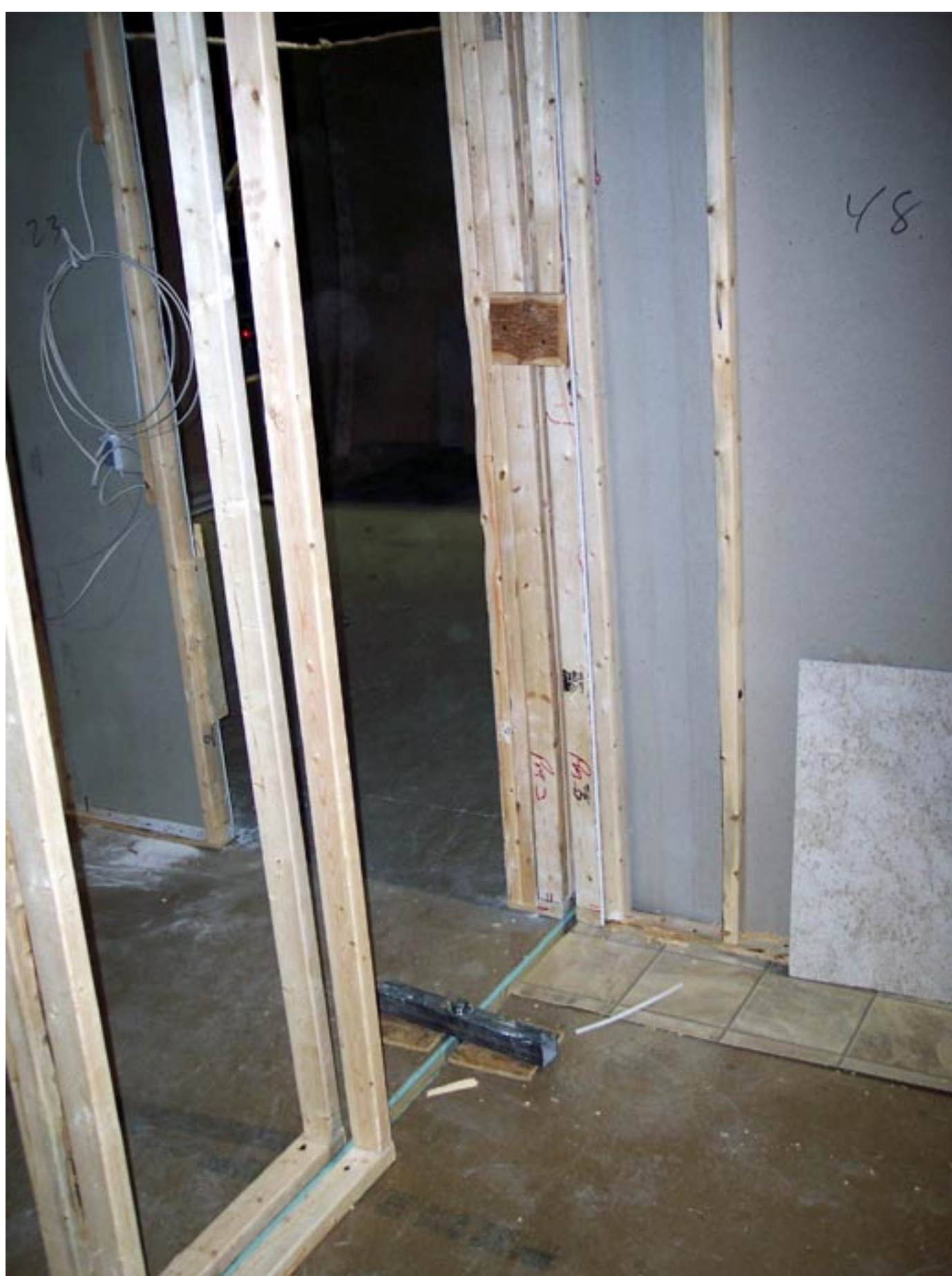
Sectional Homes are Connected During the Production Process to Ensure Alignment at Setup